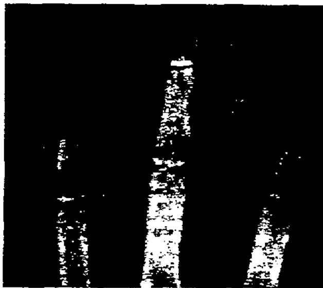
2. Mild stage of acroosteolysis with half-moon defect of distal phalanx of mid finger.