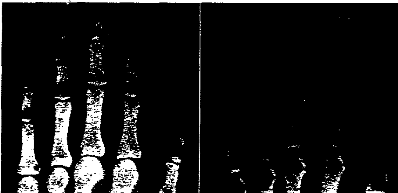
4. Left, Healed acroosteolysis with only minor roentgenographic changes. Right, Same individual one month after crushing injury to midfinger.

The polymerization operations are carried out in closed processes and provide little opportunity for employee exposure. Following the completion of the polymerization reaction, periodic cleaning of the walls and agitator of the polymerizer is necessary. The frequency of this cleaning and its method varies with the type of material used in these vessels and with different manufacturers. The most common practice has been to accomplish the cleaning manually by using hand scraping techniques, with workers spending several hours each day on this job assignment. Personnel performing this job are commonly referred to as "polycleaners."