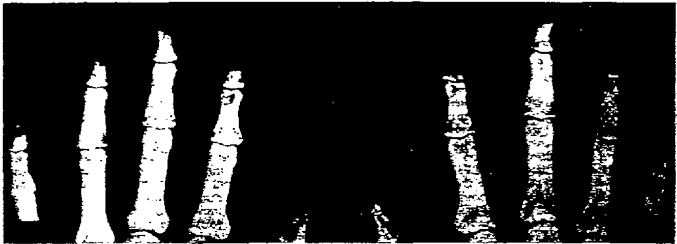
3. Above, Acroosteolysis with marked fragmentation of distal phalanges in November 1965. Below, Same individual in November 1966.

4. Healing stage: In this phase, there is often definite fragmentation of the remaining tuft and of the filled-in area where the previous destruction was noted through the shaft of the distal phalanx. This may go on to a complete bony union or remain as a fibrous union with fragmentation. In Fig 3 and 4, x-ray films of the same individual well demonstrate this. This employee had almost complete reunion of the multiple fragments when first seen in November 1965 and again in November 1966 (Fig 3). In the latter, the completely healed shafts and tufts of the distal phalanges are indicated by no residual fragmentation with fibrous union. There is a definite shortening of the shaft and a widening of